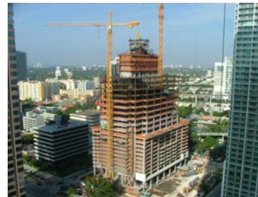
Brickell Financial Center Client: Southern Steel Tons: 4020

Please visit our website for more information on 4D — www.steel-detailing.com